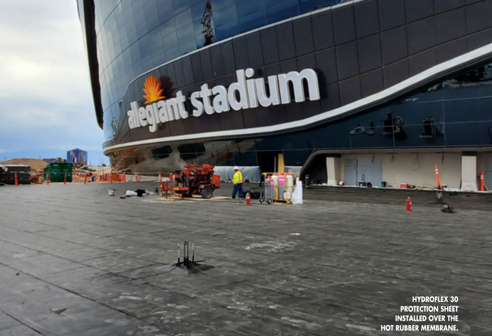
HYDROFLEX 30 PROTECTION SHEET INSTALLED OVER THE HOT RUBBER MEMBRANE.